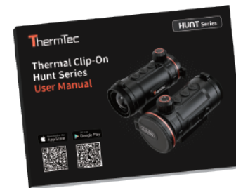
User manual (x1)